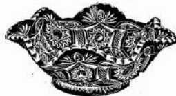
No. 3434C—5 in. berry. crimped, hand finished. packed 30 dozen in barrel. barrel lots, $0.25 per doz. smaller lots, 0.28 per doz.