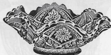
No. 3024C. 5 inch berry, crimped. packed 35 dozen in barrel. barrel lots, $0.30 per doz. smaller lots, 0.33 per doz.