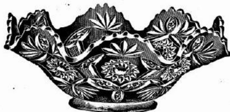
No. 3437C—9 inch berry, hand finished. packed 5 dozen in barrel. barrel lots, $0.82 per doz. smaller lots, 0.95 per doz.