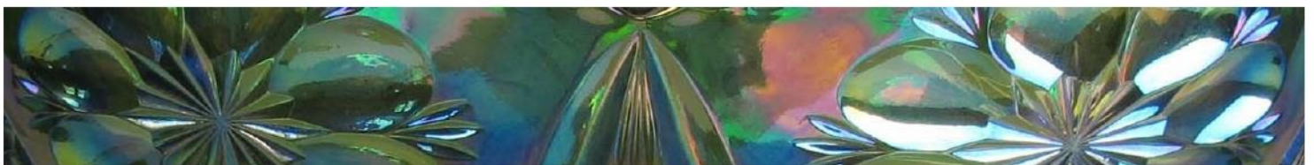
No. 3027C. crimped berry set. full finished. consisting of one 8½ inch and six 5 inch crimped berries. packed 2 dozen sets in barrel. per doz. sets in barrel lots, $2.75 per doz. sets in smaller lots, 3.00