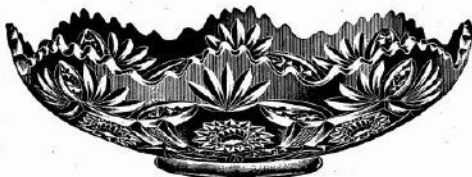
No. 3437F—9 1/2 inch shallow berry. packed 5 dozen in barrel. barrel lots, $0.82 per doz. smaller lots, 0.95 per doz.