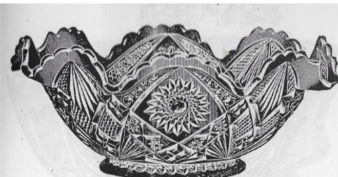
No. 3027C.—8½ inch berry, crimped. packed 5½ dozen in barrel. barrel lots, $0.90 per doz. smaller lots, 1.00 per doz.