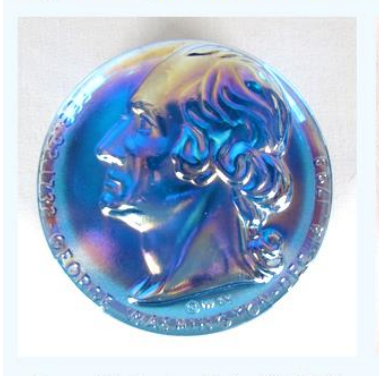
George Washington, Marked "© W 69"

Wheatoncraft made a series of paperweights in the late 1960s and into the 1970s featuring early American presidents. The paperweights are 4 inches across and one inch deep. They have no paper labels on the back as they are mostly marked on the front as being from Wheaton.