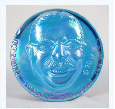
Theodore Roosevelt, Marked "© 70 W"