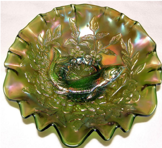
Above: Millersburg's Trout & Fly Bowl in Green