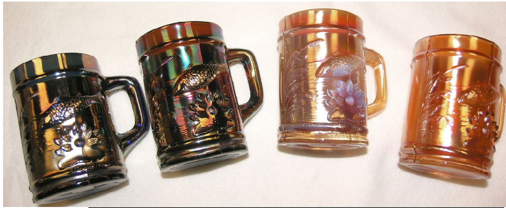
Dugan's Fisherman's Mugs in Amethyst, Blue (very rare), Peach Opal, Marigold