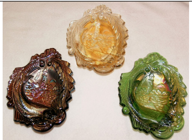
Above: Millersburg's Seacost Pin Trays in Amethyst, Marigold and Green