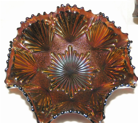
Left: Imperial's Shell & Sand bowl in Amethyst Above Right: Shell & Sand Marigold Plate