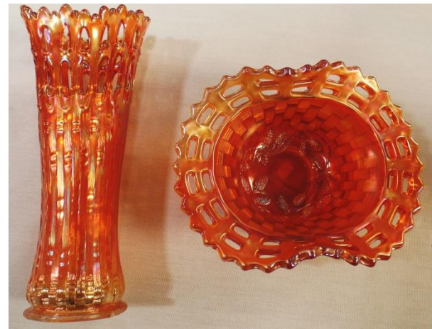
Northwood's Diamond Point Basket in Marigold