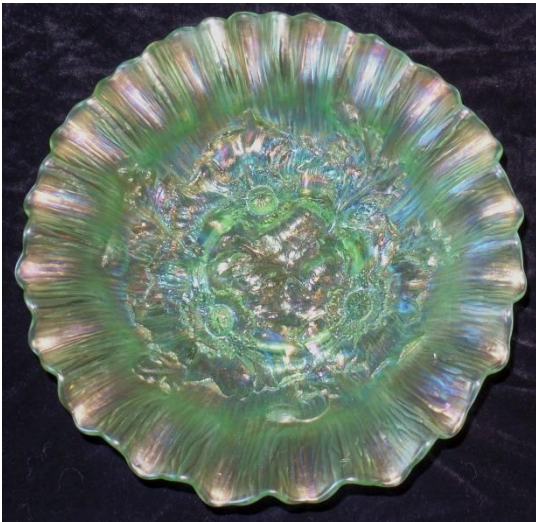
Northwood's Ice Green Poppy Show Bowl... CRE...never seen in this edge.