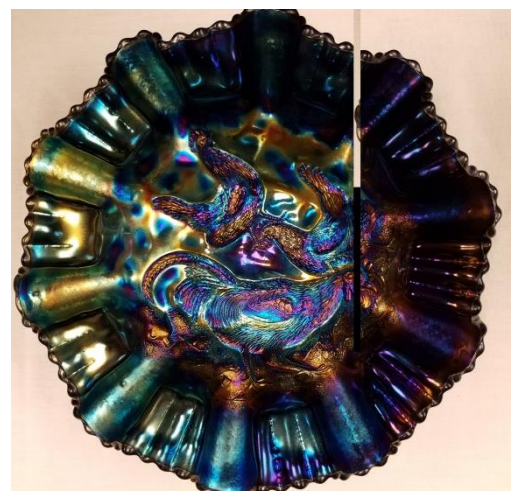
Dugan's 3-in-1 edge Farmyard Bowl in Amethyst