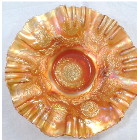
Fenton Ten Mums 3 in 1 edge in Marigold