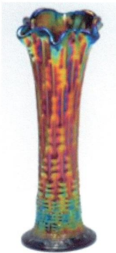
A beautiful oxblood standard swung vase from Kevin and April Clark's collection. This one, however, does not exhibit the traditional flames on top.

Swung vases are available in a variant in addition to the well-known conventional shape. Squatty vases are known in a version with a widely flared top as well as the familiar inverted cone (or ice cream cone) shape. Fruit bowl bases are often turned upside down for use as vases, and handled baskets have long functioned as flower holders.