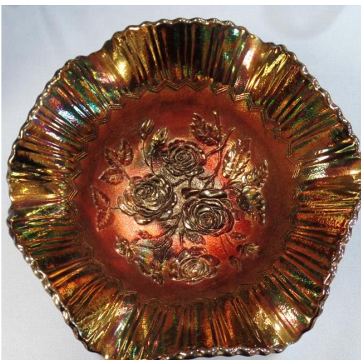
Imperial Red Lustre Rose Fruit Bowl