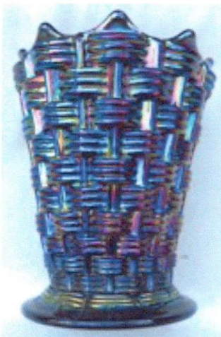
A spectacularly iridized typically-shaped squatty vase belonging to Kate and Bill Lavelle.

Typically-Shaped Non-Ruffled Round Squatty. The typically-shaped Big Basketweave squatty vase is in all likelihood the shape from which other flamed vases were configured. These nine-flamed, non-ruffled round vases range from four and three-fourth to five and one-fourth inches tall. Their tops are a little over three and one-half inches in diameter.