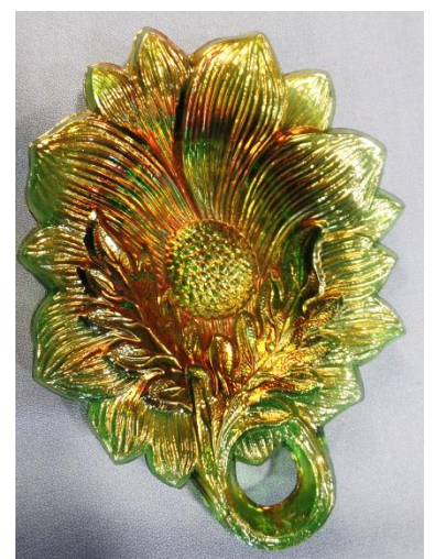
Millersburg Sunflower Pin Tray in Green