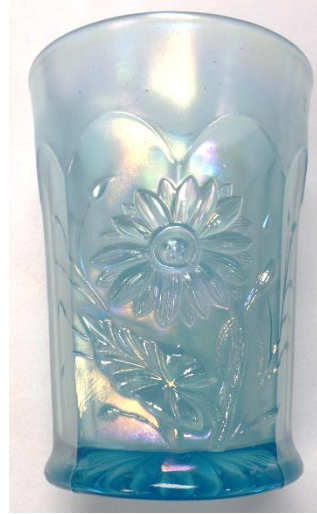
Ice Blue Dandelion Tumbler