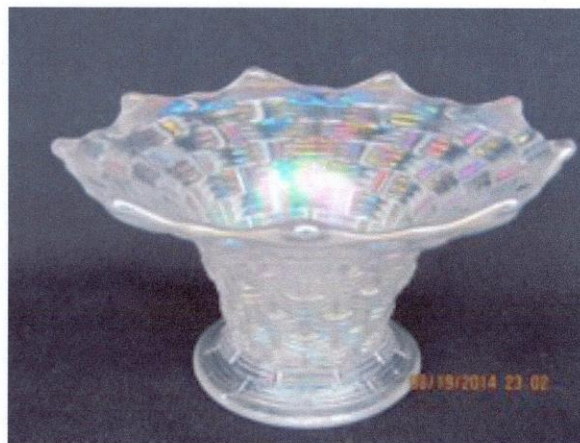
A white widely-flared vase that Tom Burns sold last fall at the Mid-Atlantic jamboree.

Flared and Flamed Non-Ruffled Round Squatty. The widely flared squatty is noteworthy because its mouth is way, way wide open, as if yawning. These vases are seen so infrequently that even veteran collectors have been surprised to learn they exist. They are in all likelihood a line-item derivative: a not unfamiliar shape made in extremely limited quantities.