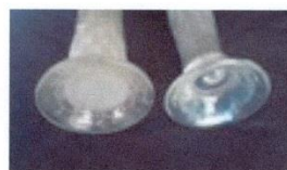
Standard and variant swung vases in white owned by Kevin and April Clark. The photo below shows the bases of the standard and variant.

Swung Variant. While the exterior patterns of standard and variant Big Basketweave vases are