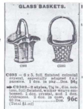
This Butler Brothers Catalog ad, 1916, shows the Big Basketweave basket beside a non-iridized Colonial basket.