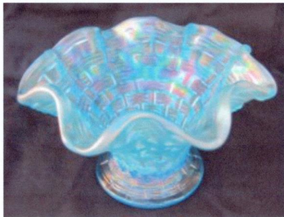
Tom Burns sold this first-reported ice blue "hat" at the 2014 Tampa Bay convention auction.

Small Basket. Made from a different mold than the large, the smaller basket, with handle, is six inches tall. The holder, without handle, is two and three-eighth inches tall. The banana-shaped bowl is three and one-half inches long, two inches wide. Its base, with a star pressed into its underside, is two inches in diameter.