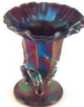
The difficult-to-come-by crimped round, above, is always an attention-getter.

Crimped JIP. The crimped jack-in-the-pulpit vases have always attracted attention because they were so artfully created. One of two "available" shapes, they have historically been the most talked about and are arguably the most popular shape. They stand from three and one-half to four and one-fourth inches tall.