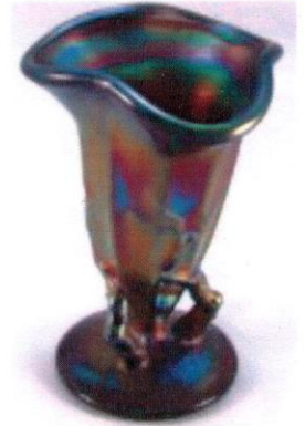
The three-ruffled rarely receives the due it deserves.

Non-Crimped Three-Ruffled (Tri-Cornered). Also a line item, the non-crimped three-ruffled is, like the JIP, an available shape. Graceful and well-proportioned, it rarely receives the accolades it deserves. These vases range from four and one-fourth to four and one-half inches tall.