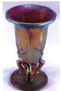
The non-crimped round, below, is probably the proof.

Crimped Round. Handsome and bold in concept, the crimped round might be thought of as a violet vase. A small spray of spring flowers or other pastel blossoms would complement the base color. Probably a line-item derivative, not many have been reported. They are four inches tall.