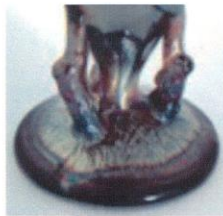
Pictured is the top of the base showing the bark pattern that is found on all but the Twigs Variant vase.

The bud vases are products of the Diamond years of the plant's operation. They are illustrated in several industry publications from the early teens to 1931, the year the firm folded.