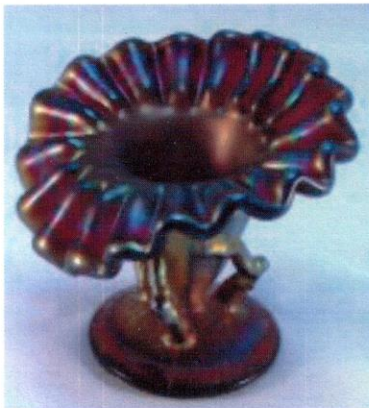
The JIP is a collector favorite.

Four of the little Twigs have previously been discussed in books, newsletter articles, and online. The other two have only recently been reported. Some standard Twigs have been "whimsied" in one way or another. Two shapes are line items, two others probably line-item derivatives, another in all likelihood a bona fide whimsey, the other presumably the proof from which all the rest were configured.