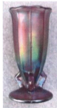
There are no twigs on the paneled portion of the Twigs Variant.