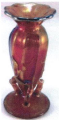
The striking spittoon shape may well be a whimsy.

The remaining shapes—two with the standard design, the other a pattern variant—are seductive because few collectors have known until now about them.