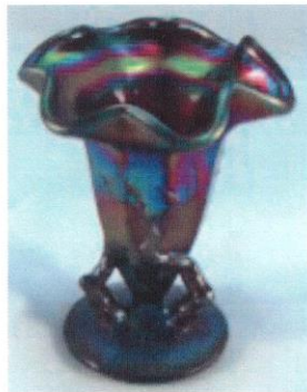
The six-ruffled is an especially attractive shape.

Non-Crimped Six-Ruffled. The six-ruffled, likely a line-item derivative, stands four and one-fourth inches tall. It is an elegant and refined shape. The most recent shape to be reported, it had been in an in an upstate New York collection for years before changing hands a few months ago.