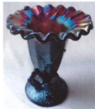
Some little Twigs are iridized only on the inside.

On occasion, little Twigs are iridized only on the inside, with just the base color visible on the outside. Kate and Bill Lavelle's crimped round, electric on the interior, is a pretty one of these.