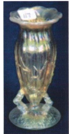
This peach opal Twigs sold in November 2014 in Mason City,