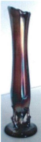
Iridescence on the bud vases often leaves much to be desired.

The cylindrical Twigs bud vases—most eight to nine inches tall, a few an inch or so taller yet—are known in marigold as well as amethyst. Most of the marigold are god-awful in appearance, clear at the bottom with weak, washed-out surface color at the top. While beautiful amethyst can be found, the iridescence is frequently a ghastly gun metal or a dreadful dull gold.