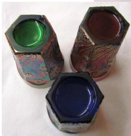
Paneled Dandelions tumblers in 3 colors: Green, Amethyst and Cobalt Blue