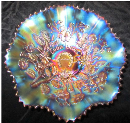
Northwood's Good Luck Ruffled Bowl in Lavender