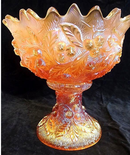
Acorn Burr's Punch Bowl in Marigold