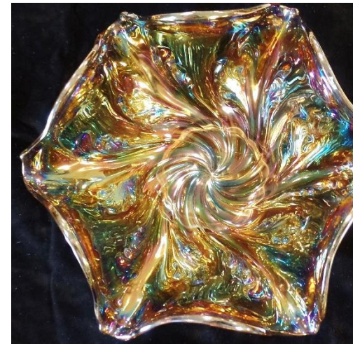
Imperial's Bowl Acanthus in Smoke