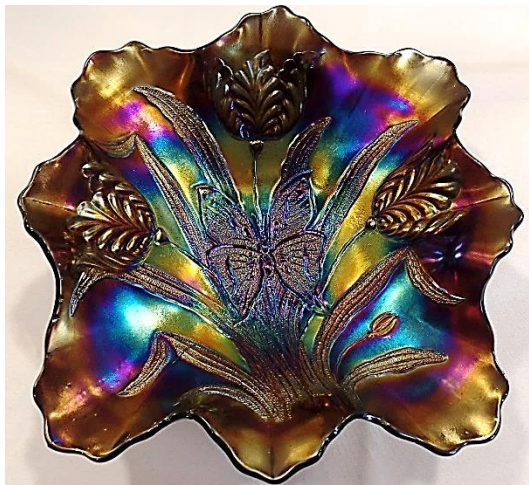
Dugan's Butterfly & Tulip Bowl in Amethyst