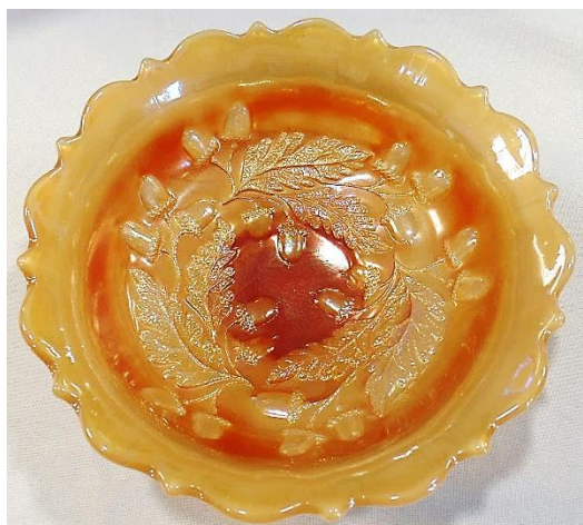
Fenton's Acorn Bowl in Marigold on Moonstone