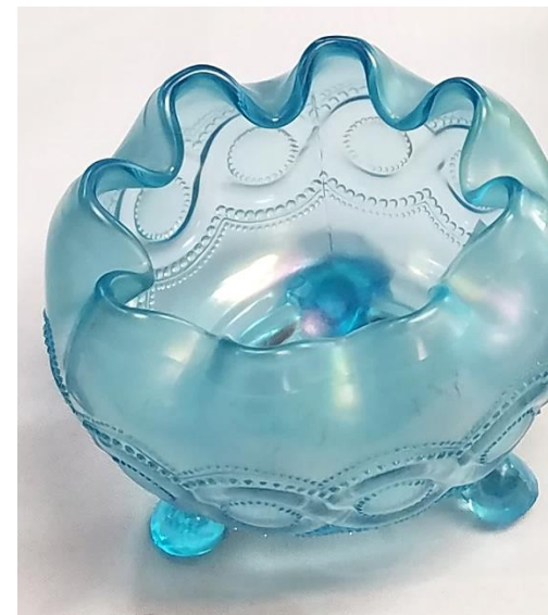
Northwood's Beaded Cable Rosebowl in Ice Blue