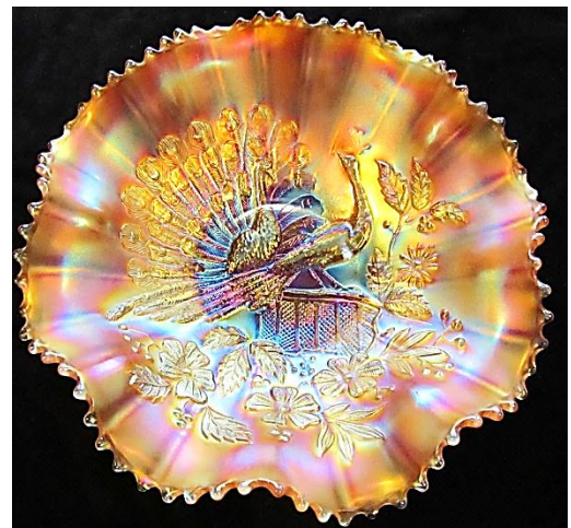
(right) Northwood's Peacock on the Fence ruffled bowl in marigold