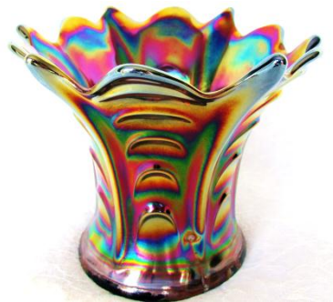
Bells and Beads by Dugan in Amethyst (top left) Butterfly with Threaded Back by Northwood (above) Parlor Panels by Imperial (right) Pulled Loops Squatty Vase by Dugan (left)