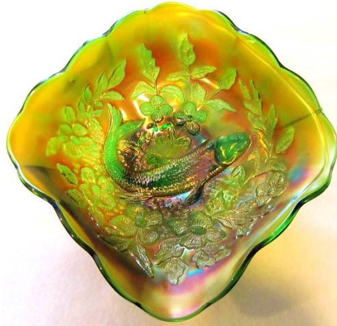
(right) Millersburg Big Fish Square Bowl in Green