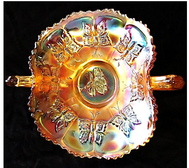
(right) Fenton's 2 Handled Bon Bon in beautiful Marigold