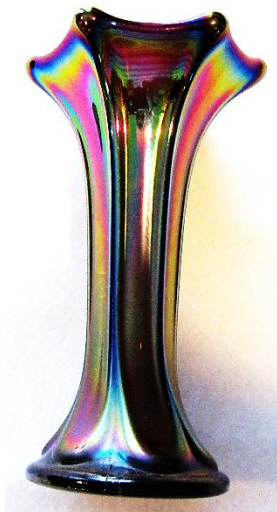
(left) 5 ½" Imperial Morning Glory Vase in Purple