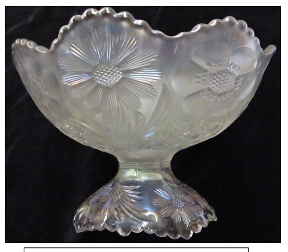
Cosmos & Cane Dome Footed Ruffled Compote in White (above)