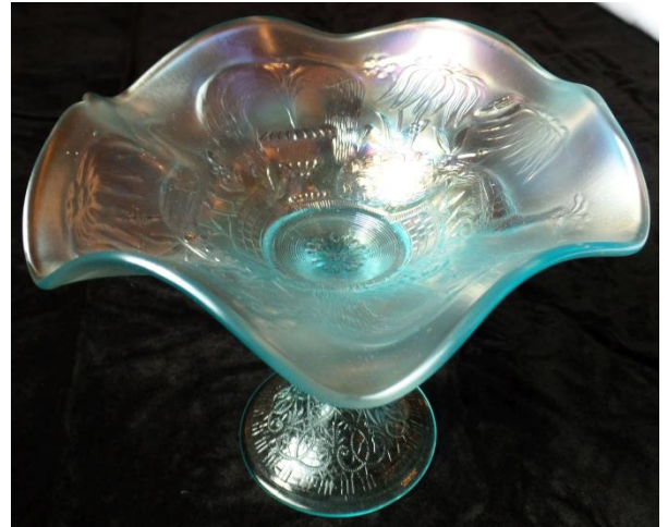
(left) Northwood's Peacock at the Fence PCE Bowl in Marigold (middle) Northwood's Peacock at the Fountain Tumbler (right) Northwood's Peacock at the Fountain compote in Ice Blue