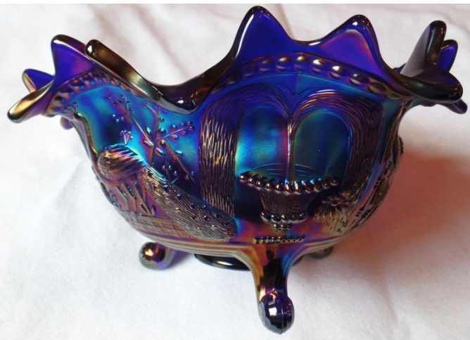
Northwood's Peacock at the Fountain Fruit Bowls in Blue and Marigold