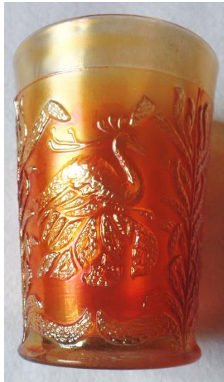
(left) Northwood's Peacock at the Fountain compote in Ice Green (middle) Fenton's Fluffy Peacock Tumbler in Marigold Fenton's Peacock & Dahlia Bowl in Marigold