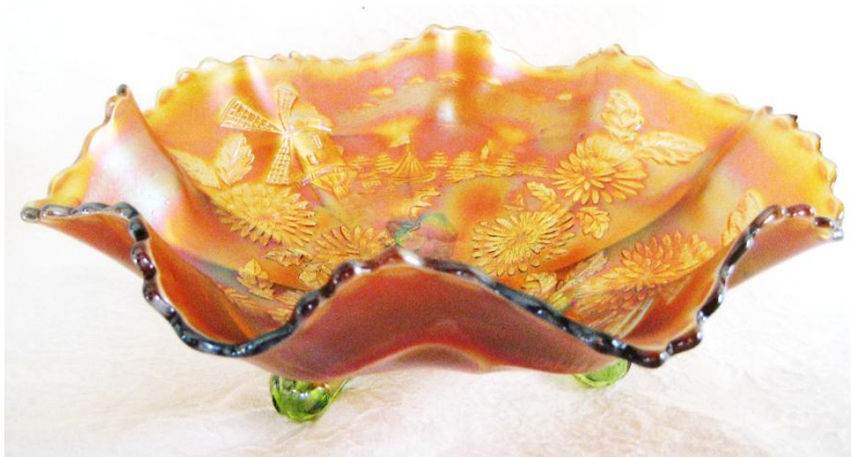
Fenton's Chrysanthemum Ruffled Bowl Sauce