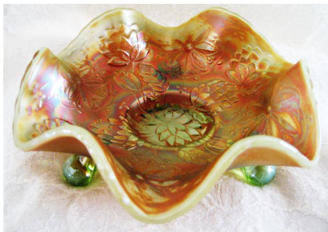
Fenton's Vaseline Opal Waterlily Ruffled Footed

What is Vaseline glass? It is crystal glass to which uranium oxide has been added. Amounts may vary from 1/2% up to as much as 2%. True yellow Vaseline has 2%. Fenton was the largest producer of Vaseline glass. Imperial produced very little true yellow Vaseline but fair amounts of lime green...mostly in the Imperial Rose and Ripple patterns. Vaseline glass glows under a black light. It was produced in the last part of the 19 th century and is still produced today.