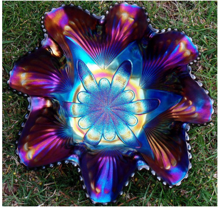
8 Ruffled Large Bowl