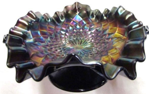
Dugan's Folding Fan Compote in Amethyst