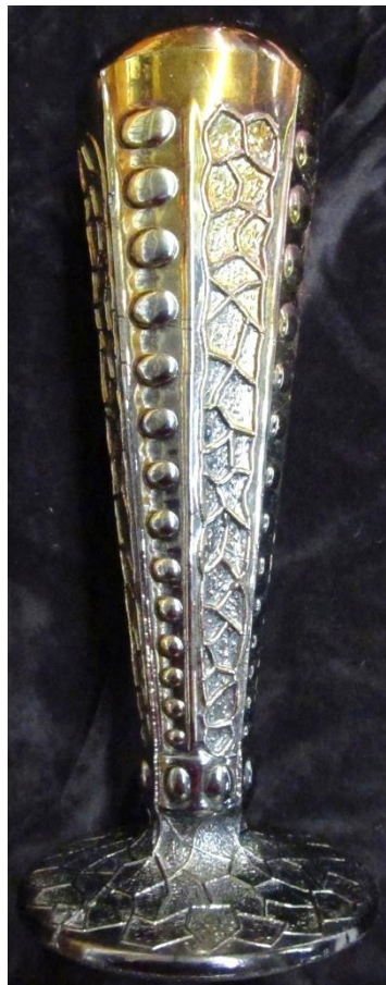
Formal Hatpin in Amethyst