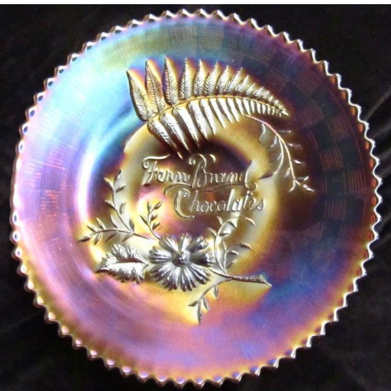
Northwood's Fern Brand Chocolate Advertising Plate in Amethyst