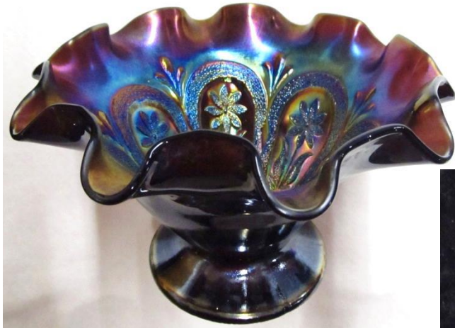
Elks 1914 Parkersburg Plate in Blue