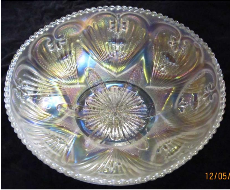
Ice Cream Shape Large Bowl