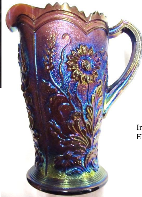
Imperial Fieldflower Water Pitcher in Electric Purple