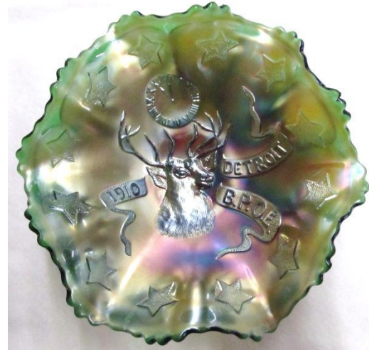
1910 Detroit Elks Bowl in Green