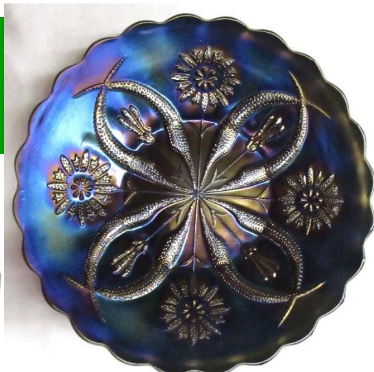
Four Flowers Variant Plate

SHOW & TELL THEME "G" & "H" PATTERNS & NEW FINDS