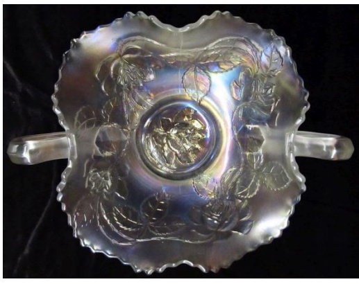
3 & 1 Edge Bowl in Blue (left) Dugan's Question Mark Cake