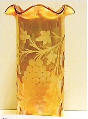
Vase # 2- Engraved Grape Funeral- Size 11-1/4" Tall, 6" Wide Top, 5"Base

Vase # 2 there are 26 grapes in a cluster with vines extending around the vase with 16 engraved flowers that have 5 flower petals. NOTE: this funeral vase with its 5" base also has a 6-ruffled top.