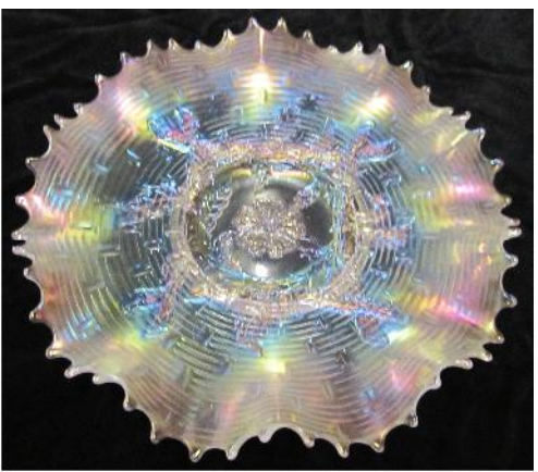
Above: Dugan' Apple Blossom & Twig Plate Below: Northwood's Beaded Cable Rosebowl, Leaf & Beads Rosebowl and Finecut and Roses Rosebowl