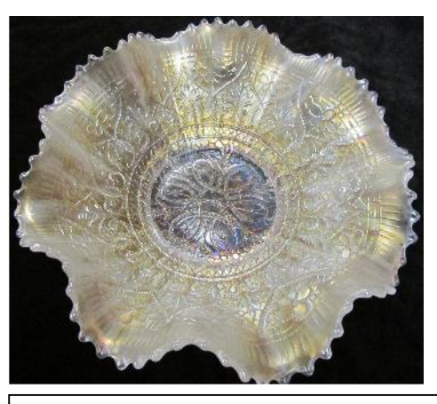
Above: Northwood's Hearts & Flowers Ruffled Bowl Left: Singing Birds Mug Below: Painted Carniva/Stretch Dish with Cover