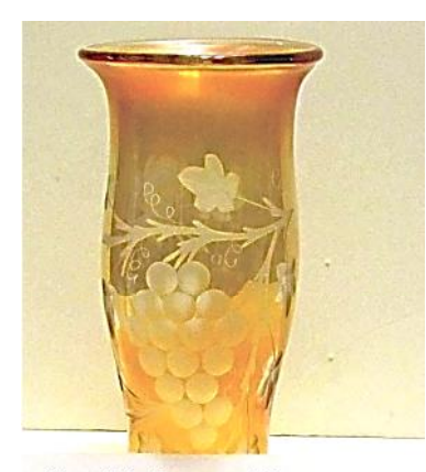
Vase # 1- Engraved Grape Mid- Size 10" Tall, 4-5/8" Wide, 3-7/8"Base

The Engraved Grape pieces shown below are prime examples of their Gold Iridescent Crystal. It has not been