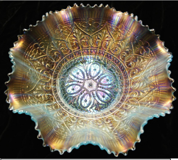
Northwood's Hearts & Flowers ruffled bowl in Ice Blue