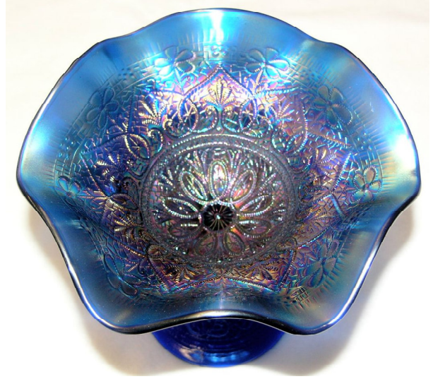
Northwood's Hearts & Flowers Compote in Electric Blue