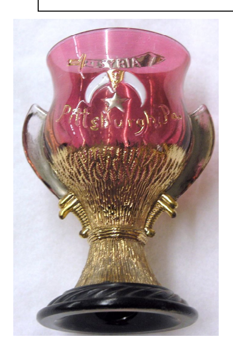
Left: 1908 Shriner's Cup

Right: Aqua Opal Hearts & Flowers Compote