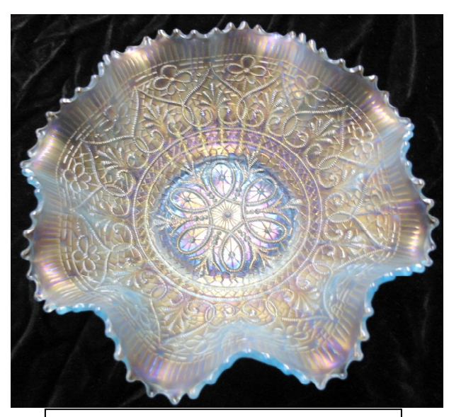
Northwood's Hearts & Flowers Ruffled Bowl in Ice Blue