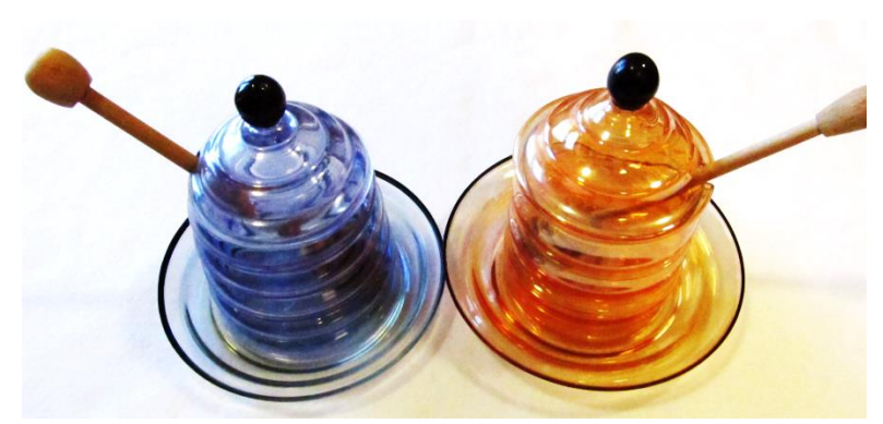
A new find...

Honey pots in Blue and Marigold made in the 1920's in Ohio