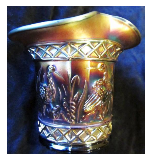
Dugan's Stork & Rushes 2 sides up hat from a tumbler in Blue

Miniature Stippled Estate Vase in Peach Opal by Dugan...only 3 inches tall