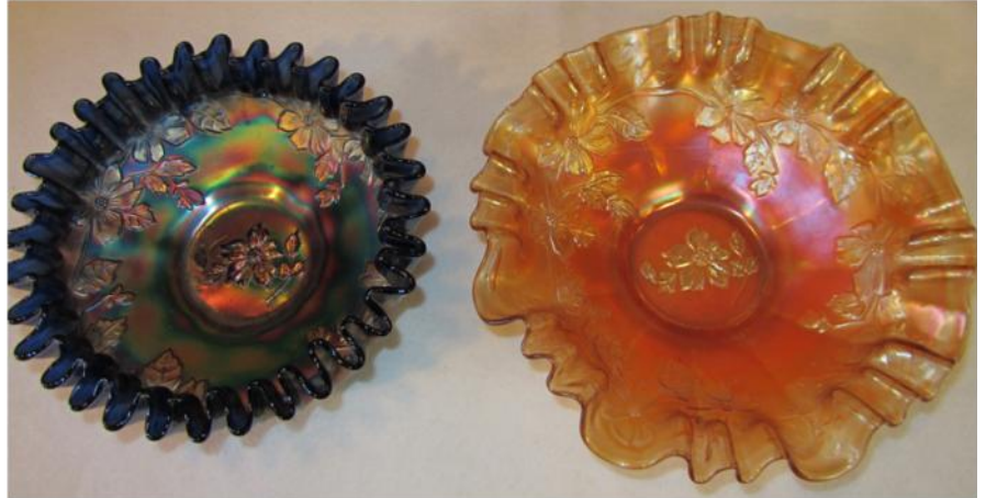
(left) Northwood's Peacock on the Fence Ruffled Bowl in Electric Blue (right) A Plate in Amethyst (above) Fenton's Ragged Robin in a rare CRE in Blue (hard to find in this edge). Also a 3 in 1 edge bowl in Marigold-scarce