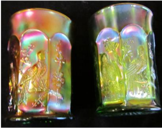
To my left...Singing Bird tumblers in green...the one on the right is emerald...both beautiful