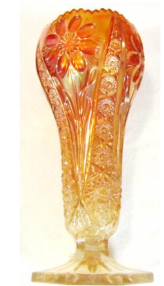
(left) Dugan Mary Anne Vase in Marigold (made in 1911-1912)