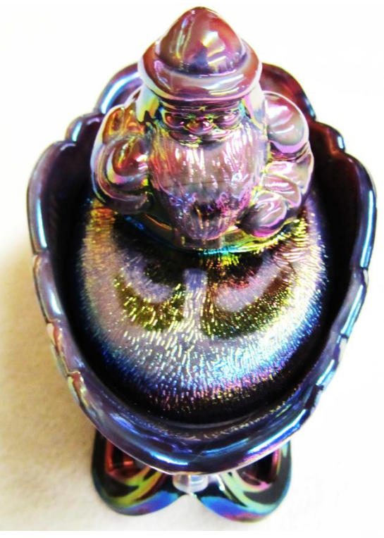
Westmoreland Santa Claus