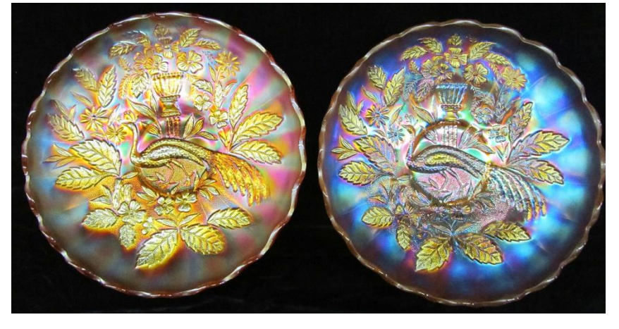
Northwood's Peacock at the Urn in Marigold and Blue