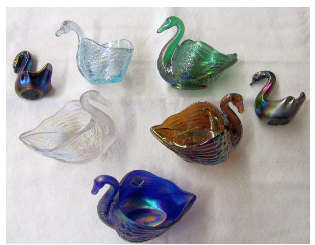
Seven Swans a Singing....

Northwood's Poinsettia and Lattice Ruffled Bowl in Ice Blue