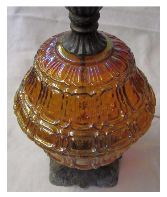
A mystery lamp for $6.00...who made it, when????

Fenton's Holly ruffled compote and goblet in Red