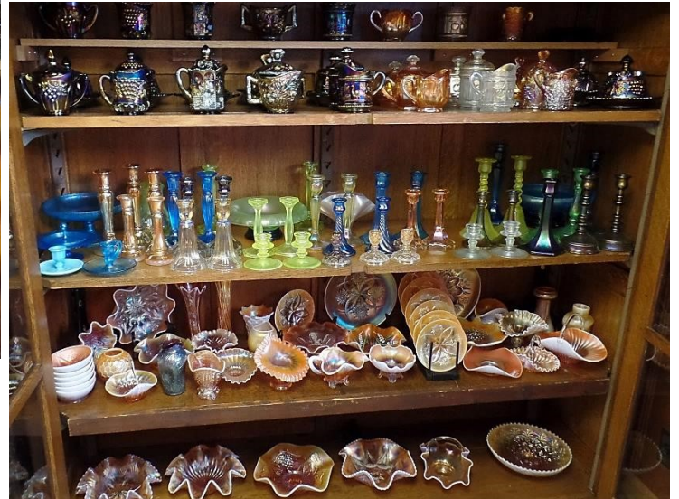
Table sets, Candlesticks and Peach Opal...oh, my!