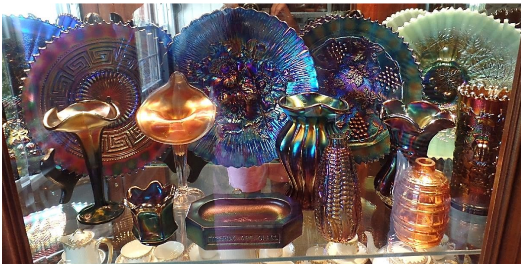
Kris's favorite shelf...she wants them ALL!