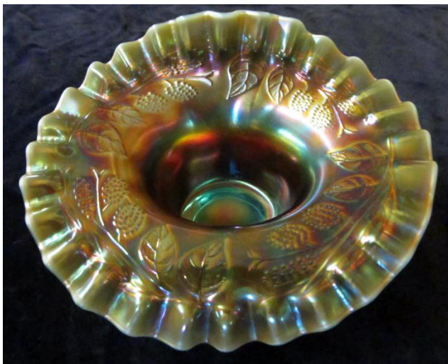
Fenton's JIP Blackberry Spray Hat in Aqua Opa