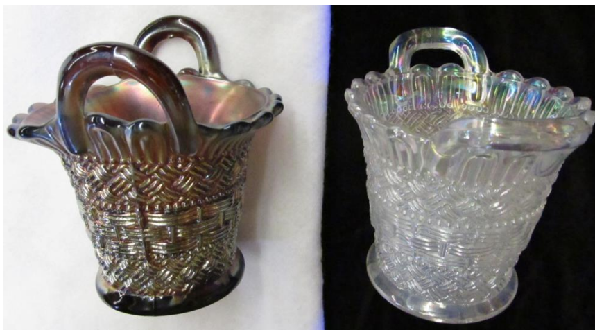
(above) Diamond's Beaded Basket in amethyst and white (on the right/top: Fenton's Two Row Two Sides Up Open Edge Basket in Reverse Amberina Opal (right) Dugan's Daisy Web Ruffled Hat in gorgeous amethyst