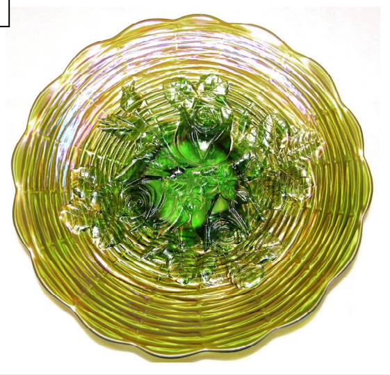
Imperials Pansy dresser tray and Oval Relish Tray both in Amber