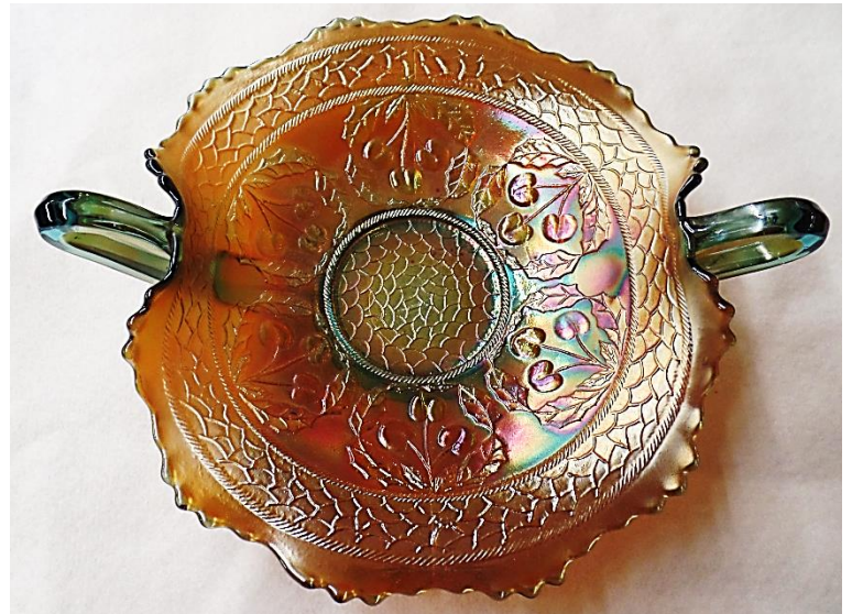
Dugan's Sprialex Vase in Aqua