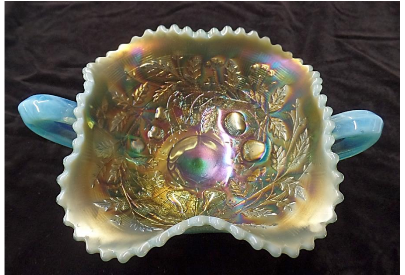
Northwood's Fruits & Flowers Bon Bon in Aqua Opal