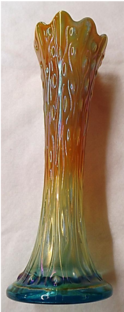
Northwood's Tree Trunk Vase in AO with a butterscotch overlay