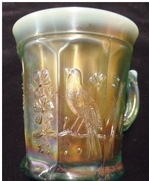
Northwood's Singing Birds Mug in AO